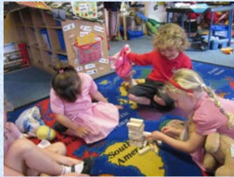
Playing team games like jenga