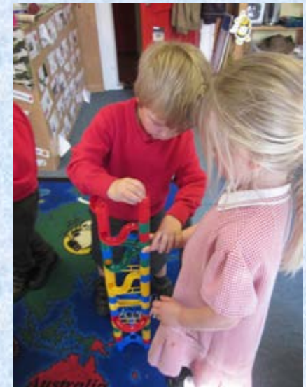
Making our own marble runs