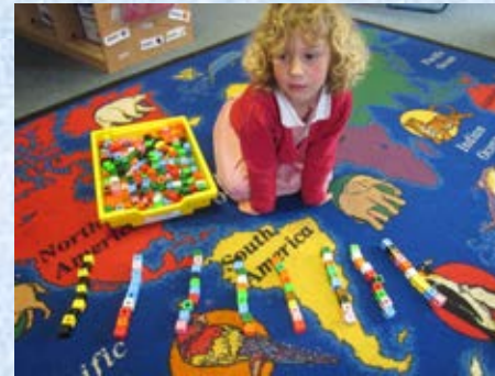
Counting in tens