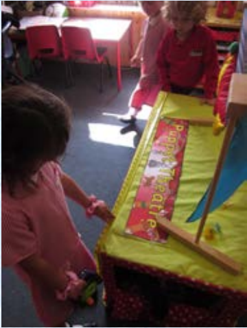
Measuring things around the classroom