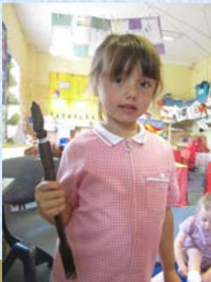
Exploring things from Africa